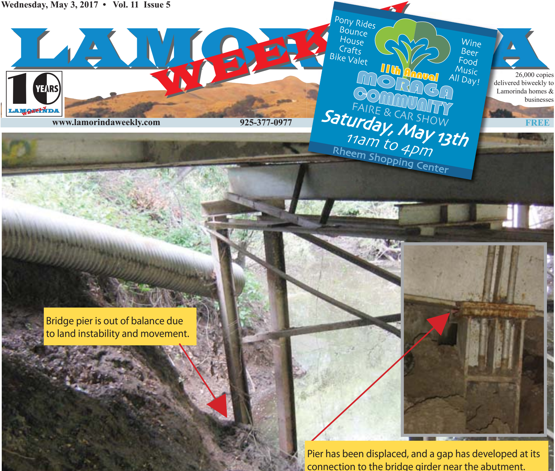
A landslide reached and damaged the Canyon Bridge foundation.